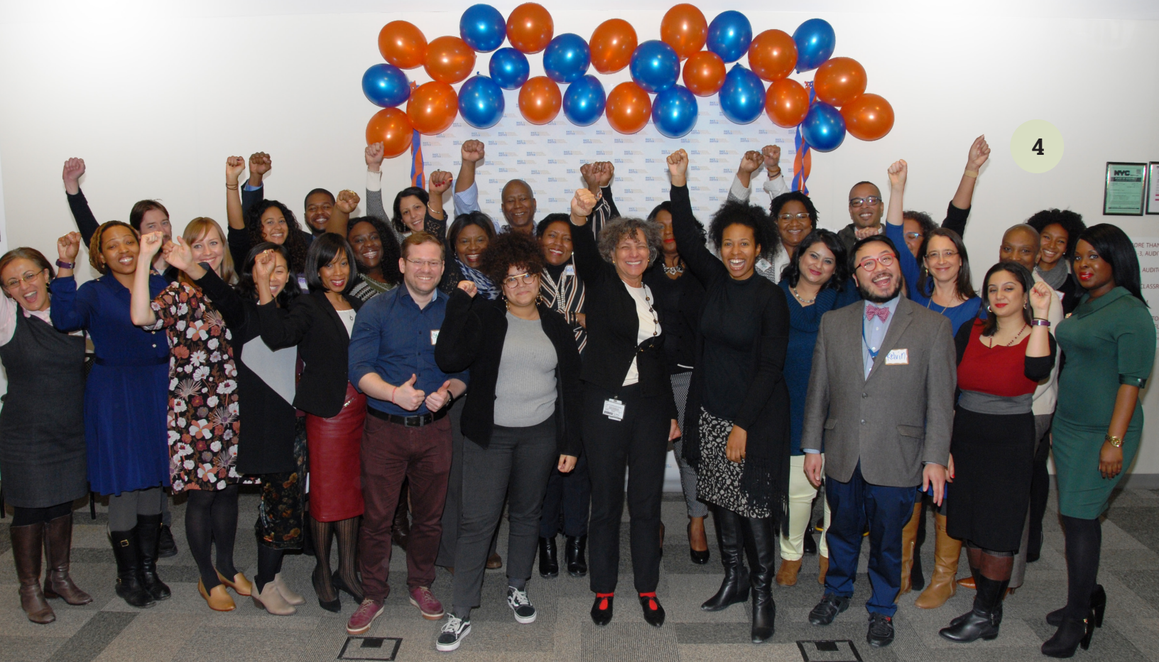
ABOVE: Racial Equity Core Team, New York City Department of Public Health and Mental Hygiene.