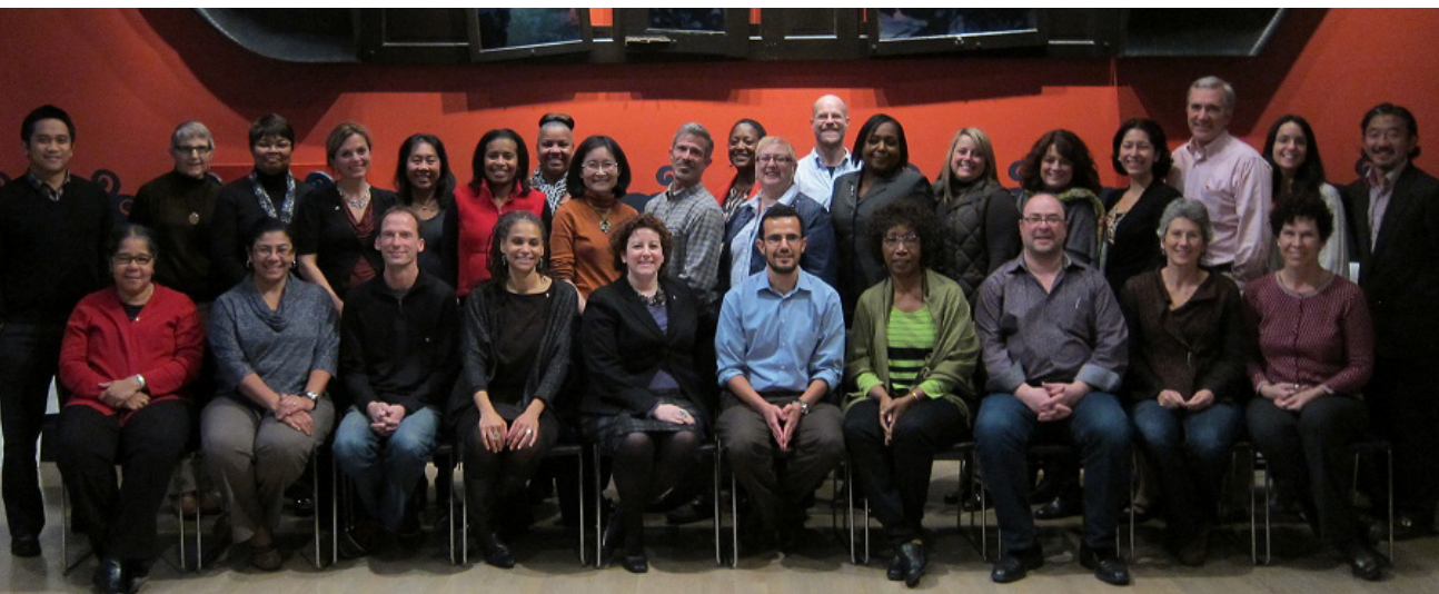
LEFT: The Inter Branch Team, King County, WA.

Ultimately, the goal of the Core Team is to reach and engage all units and levels of an institution—and every employee—in using a racial equity framework (analysis, tools and strategies) in their daily work and routine decisions. The work of racial equity is critical to the mission of any government jurisdiction that truly wishes to engage and serve all of its constituents fully and fairly. By doing so, jurisdictions can move from being passively part of the problem to actively part of the solution. When the Core Team increasingly and continually embeds the vision and values of equity in all facets of governance, an inclusive democracy and an equitable community become possible.